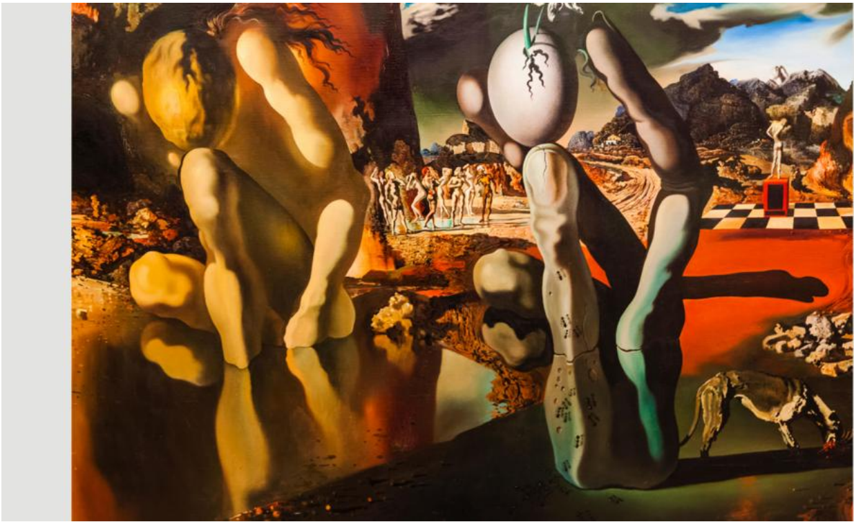
Cath Pound - BBC Culture